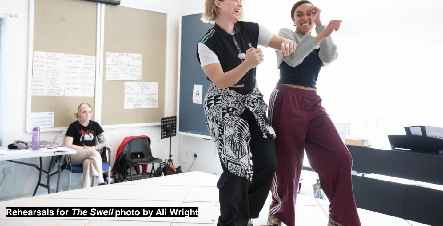
Rehearsals for The Swell