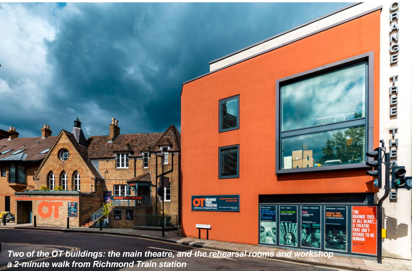
Two of the OT buildings: the main theatre, and the rehearsal rooms and workshop a 2-minute walk from Richmond Train station