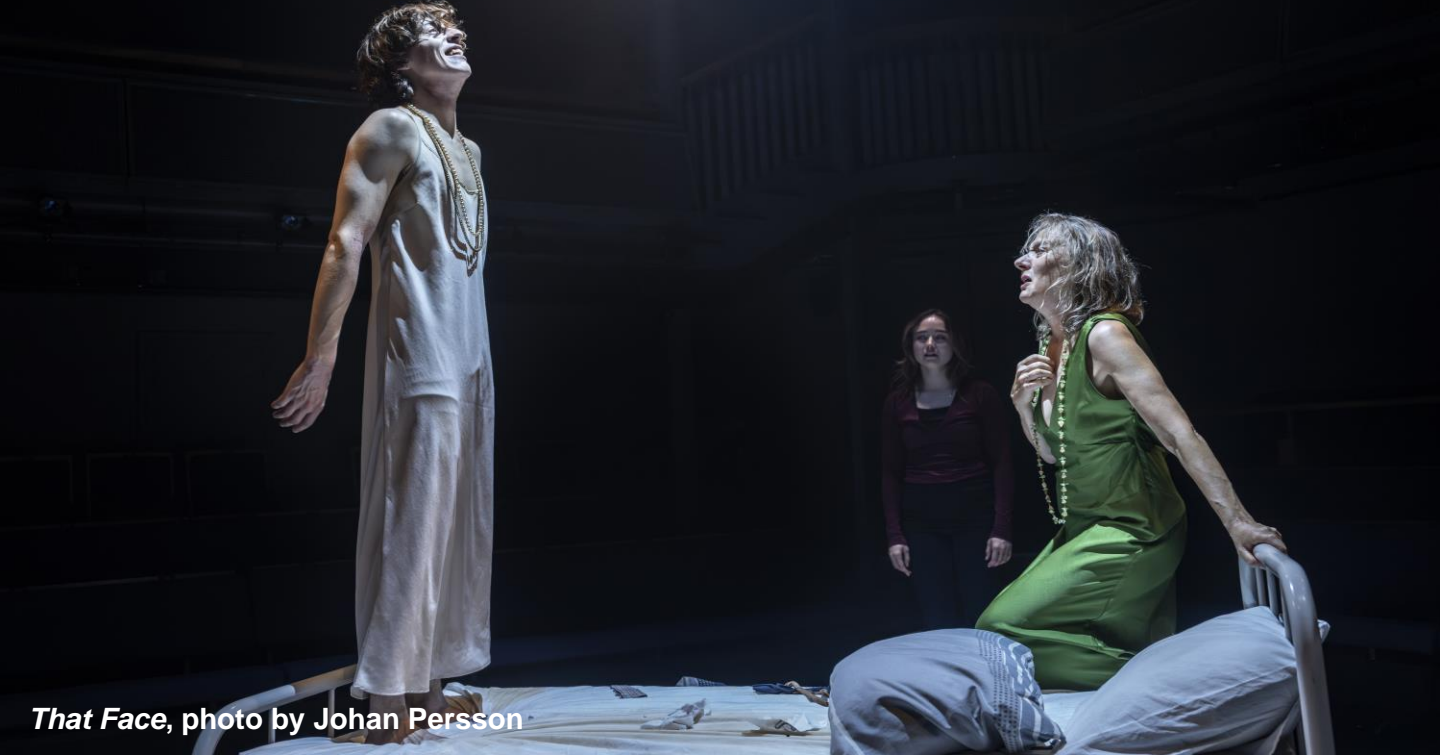
That Face